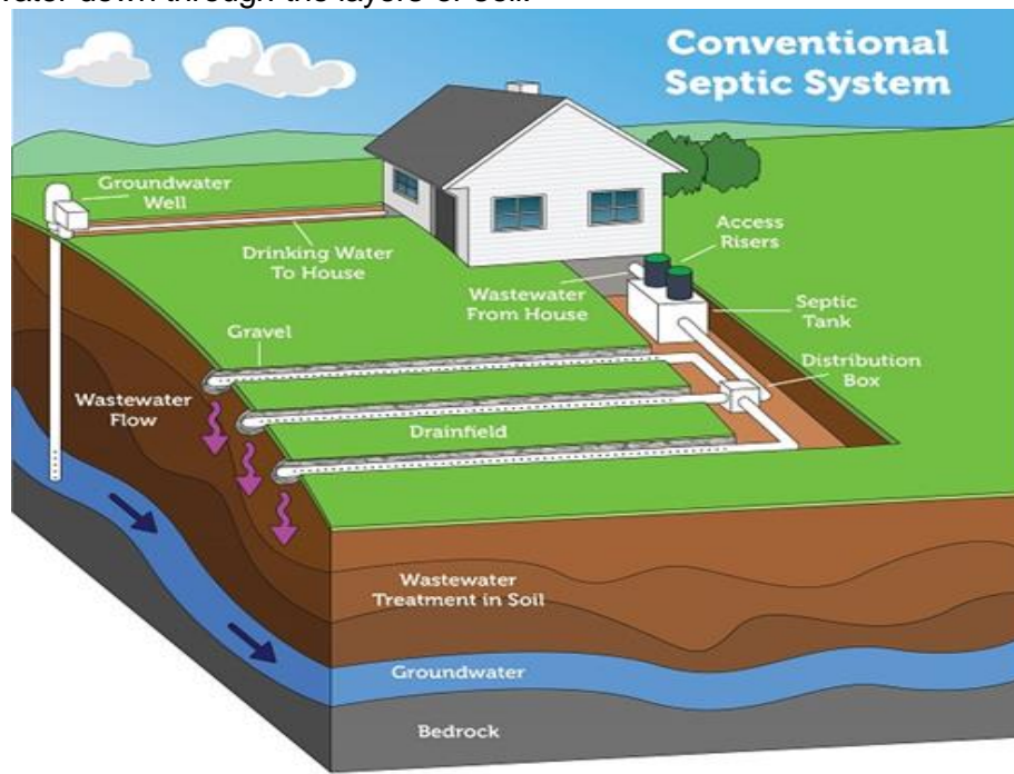
Please note: Septic systems vary. Diagram is not to scale.

An OSTDS generally consists of two basic parts: the septic tank and the drainfield. 41 Waste from toilets, sinks, washing machines, and showers flows through a pipe into the septic tank, where anaerobic bacteria break the solids into a liquid form. The liquid portion of the wastewater flows into the drainfield, which is generally a series of perforated pipes or panels surrounded by lightweight materials such as gravel or Styrofoam. The drainfield provides a secondary treatment where aerobic bacteria continue deactivating the germs and it also provides filtration of the wastewater as gravity draws the water down through the layers of soil. 42